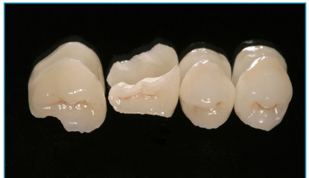
Figure 6. Milled, stained and glazed TriLux ceramics ready for bonding.