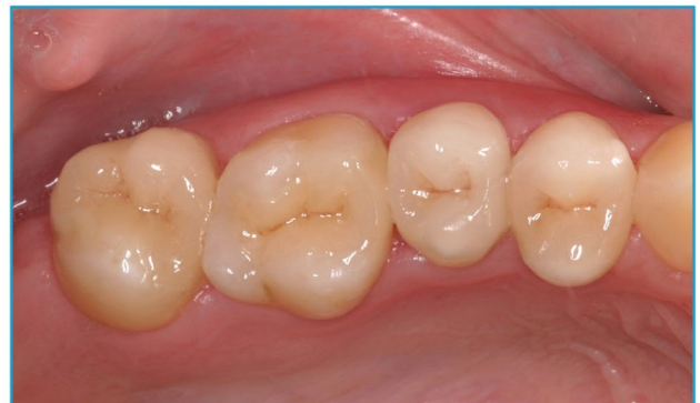
Figure 8. Occlusal view of metal-free restorations at 1 week demonstrates the precision and blend of CAD/CAM technologies.