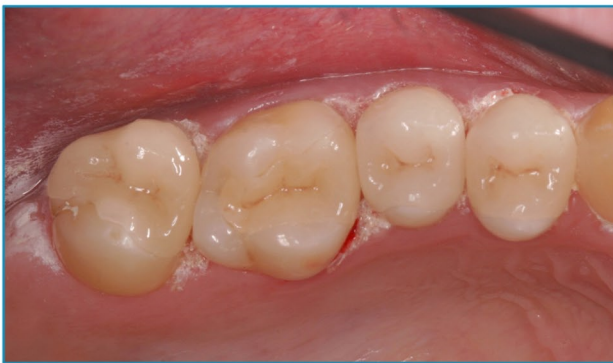
Figure 7. Try-in of TriLux ceramics prior to bonding. Note the accuracy of dry restoration fit.