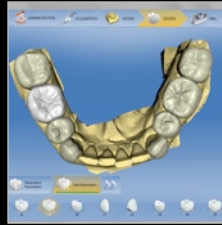
CEREC Learning Center