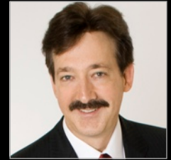
CEREC Liftoff Online & Mentoring Program at cadstar.org