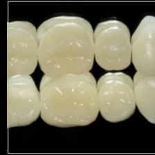
CADStar presents 4.0 full arch impressions and virtual design